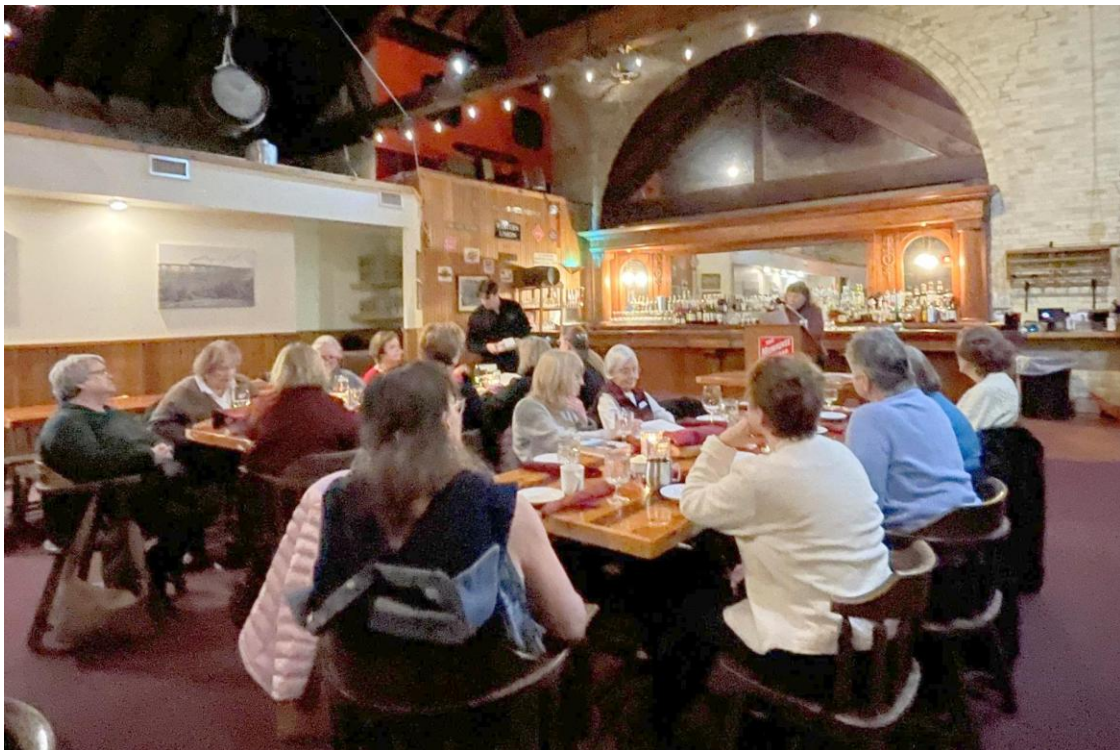
It was nice to hear about everyone's favorite Valentine experience.