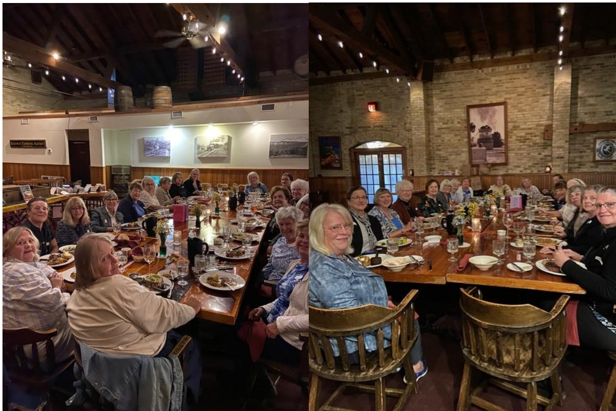
It was nice sitting as one big group.